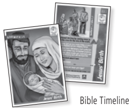
Bible Timeline Collector Cards