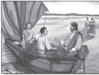
Bible Teaching Pictures

The resource CD is full of materials to help you teach. You will find PowerPoint slides with the words to all the songs on the song CD, song sheets that match the songs, 66 resources referred to in the lessons, and 192 coloring pages based on the animated Bible accounts DVD. Follow the clear instructions in the lessons for using these helpful resources.